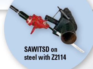
SAWITSD on steel with Z2114

14 TPI (teeth per inch) work best on at least 1/8" wall thickness. 8 TPI work best on walls at least 3/16" thick. Choose 8 teeth per inch for softer materials like plastic.