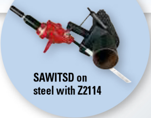
SAWITSD on steel with Z2114

14 TPI (teeth per inch) work best on at least 1/8" wall thickness. 8 TPI work best on walls at least 3/16" thick. Choose 8 teeth per inch for softer materials like plastic.